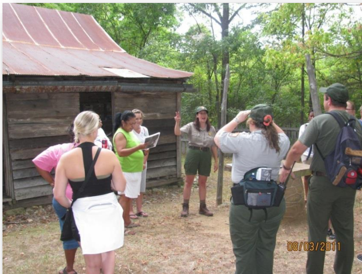
At a homestead in Buffalo NR

1:45pm head back to Little Rock (140 miles)