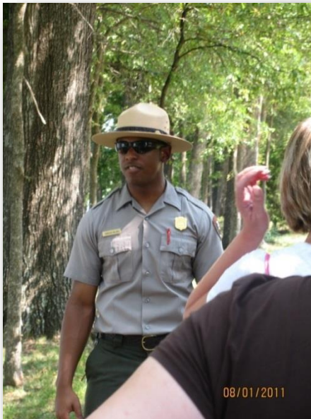
Program at Arkansas Post NM