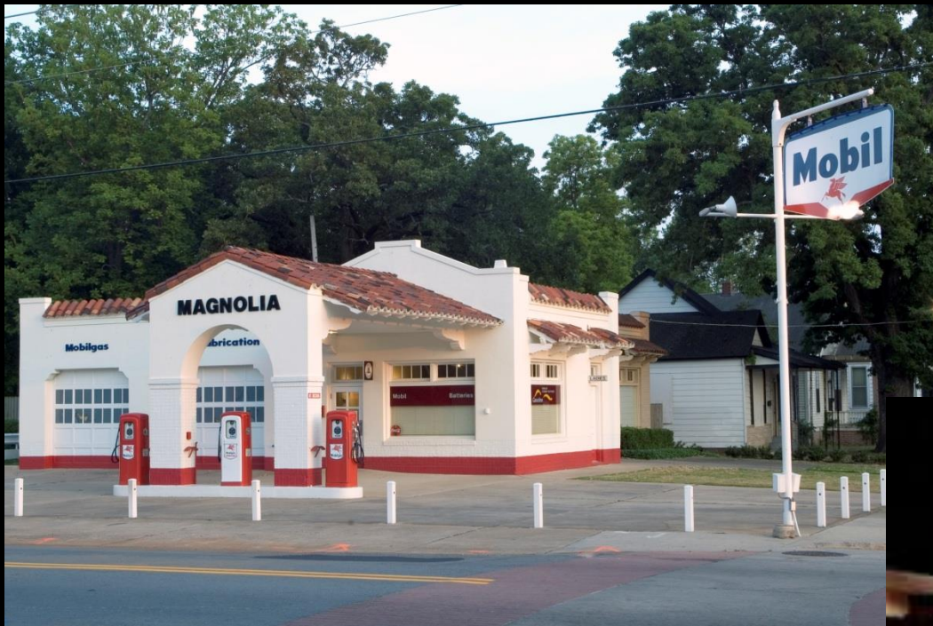
Former Visitor Center