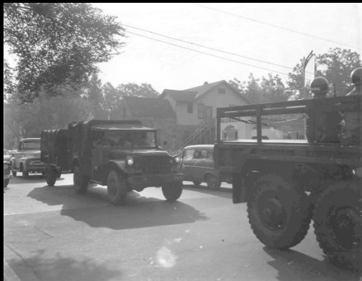
National guardsmen arrive in 1957