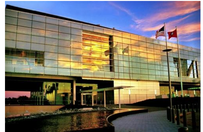
Clinton Presidential Library