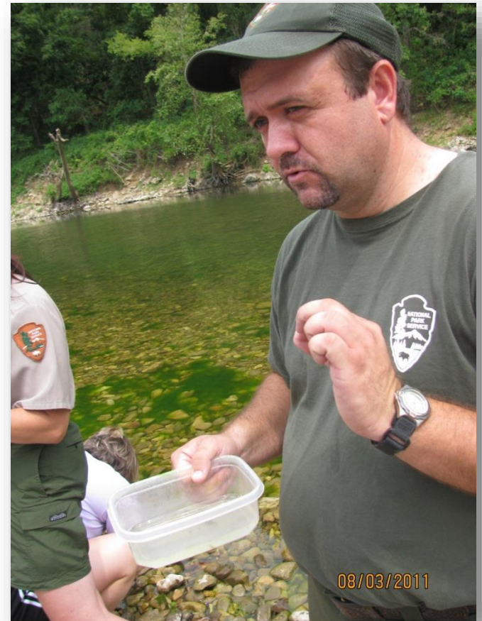
Day by the Buffalo program