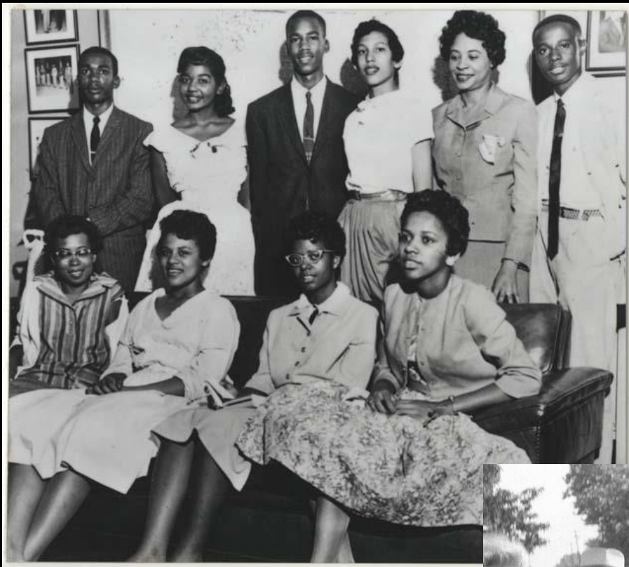
Little Rock Nine and Daisy Bates