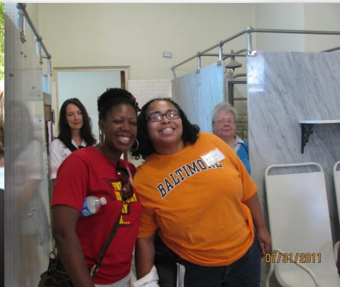
Teachers at Hot Springs NP