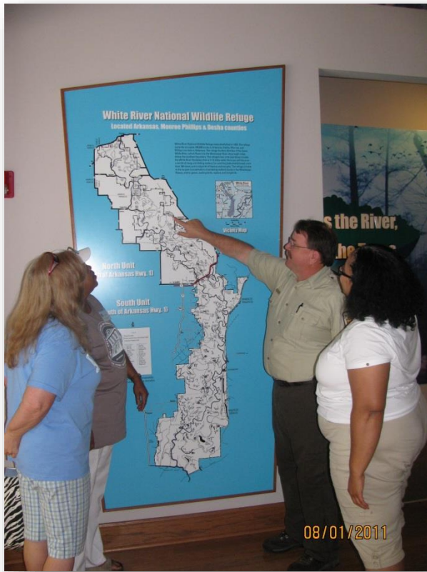
White River National Wildlife Refuge