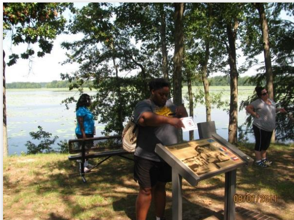
Teachers at Arkansas Post NM