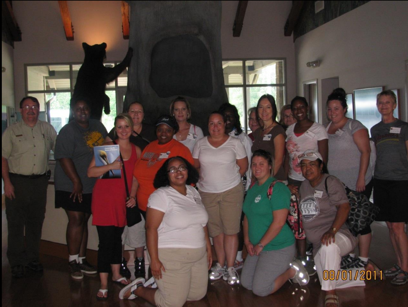
Teacher workshop at White River National Refuge