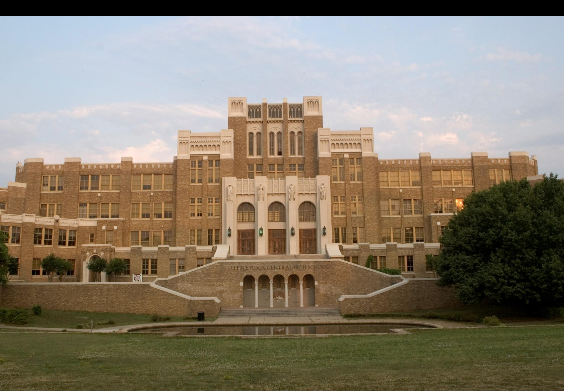
Little Rock Central High School