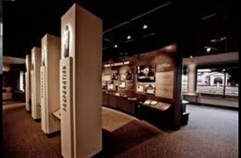
Exhibits inside Visitor Center