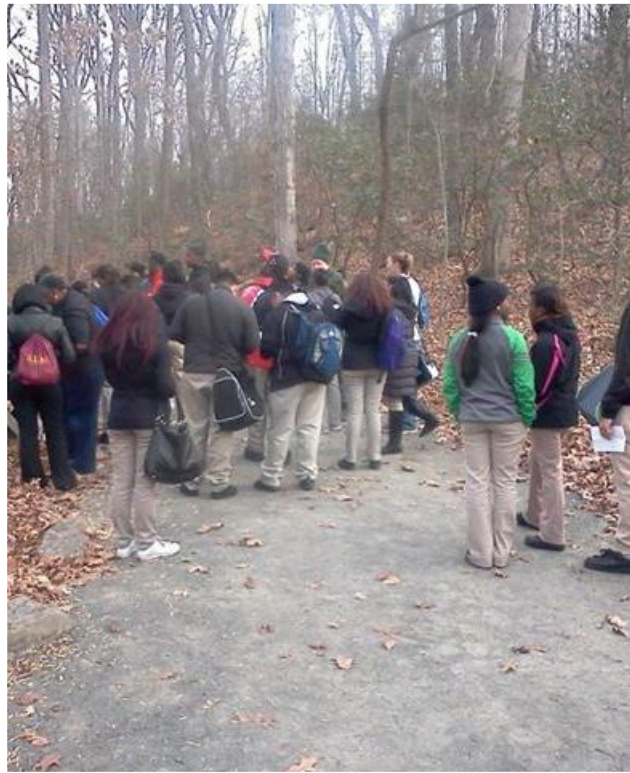
GWAR partners w/other local NPS parks like Wolf Trap to bring students to parks as part of a "Ticket to Ride Grant"