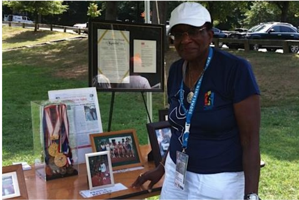
GWAR participates in NPS Community Events like "Feet in the Street"