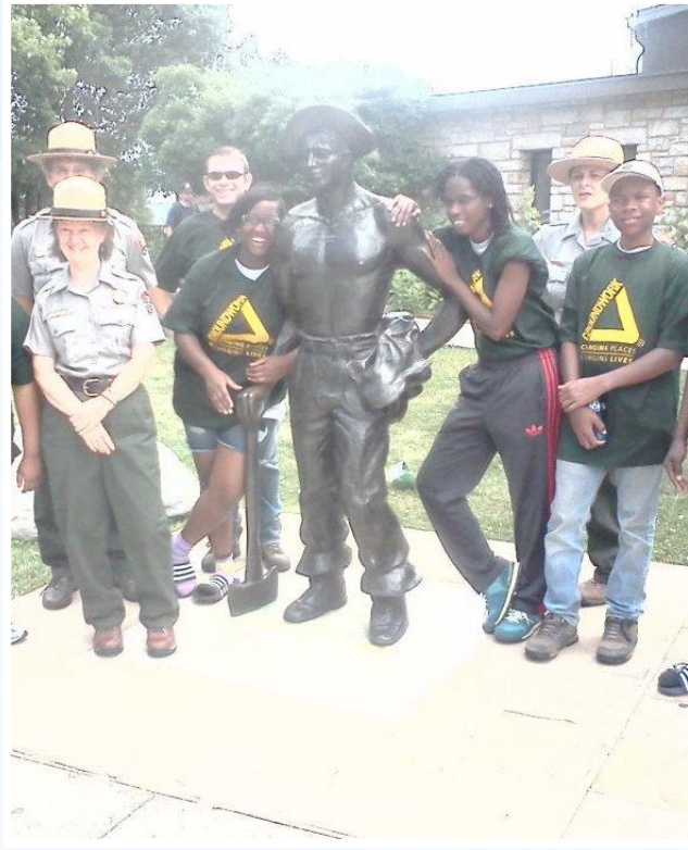
2012 Green Team went to Shenandoah w/NACE Rangers for a week