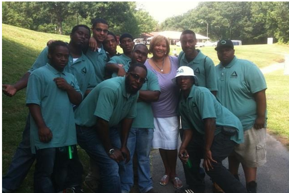
Green Teams provide summer youth employment