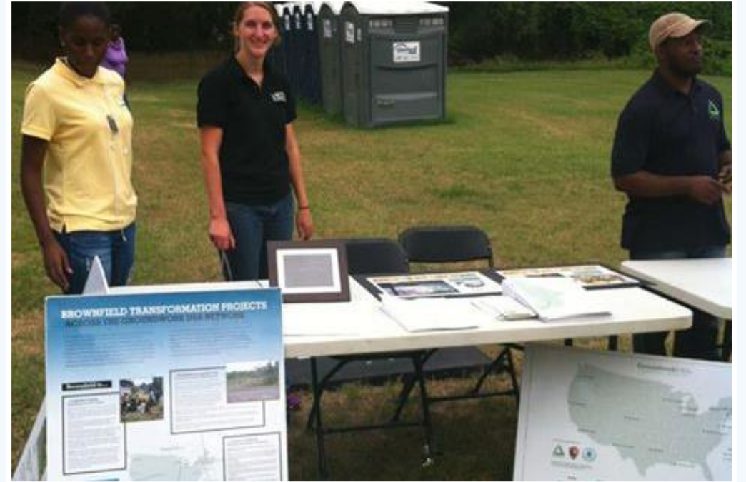
And the Fort Dupont Summer Concert to help raise community awareness