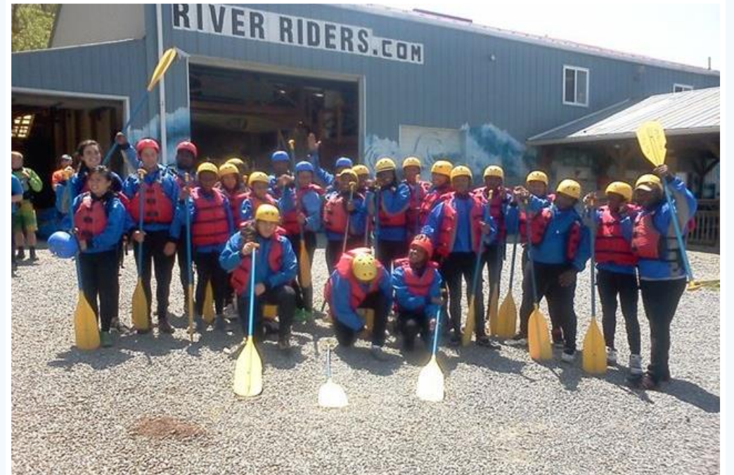
While also exposing urban youth to new recreational opportunities