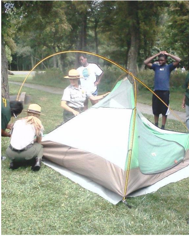
Where they learned to camp & also worked with rangers from SHEN