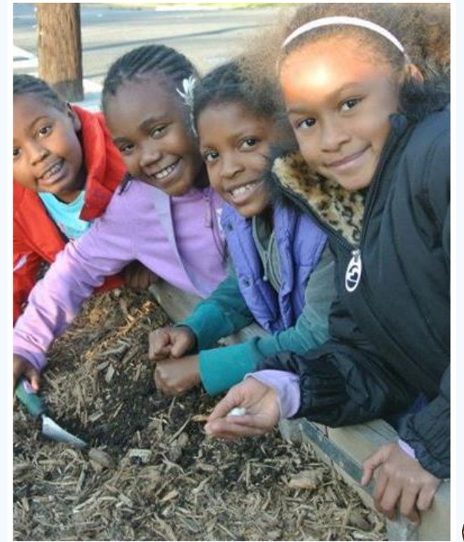
GWAR established a learning garden in Deanwood Community near Kenilworth Aquatic Gardens