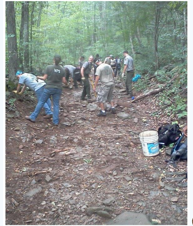
To do trail rehab & stream restoration