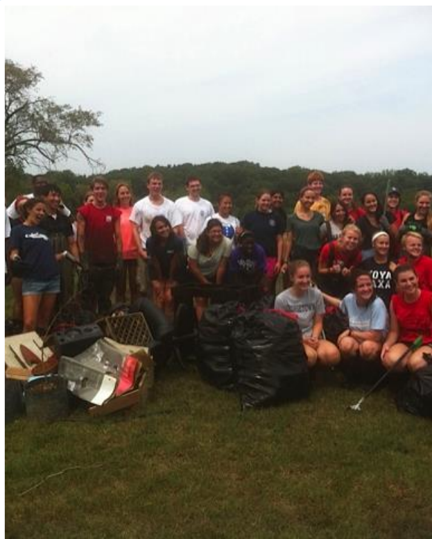
GWAR finds volunteer labor to help do projects in inner city parks