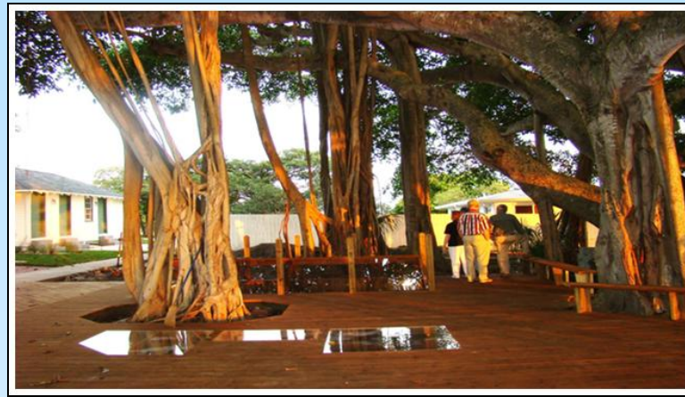
Excavation and Interpretation of the original 1860 Keeper's house