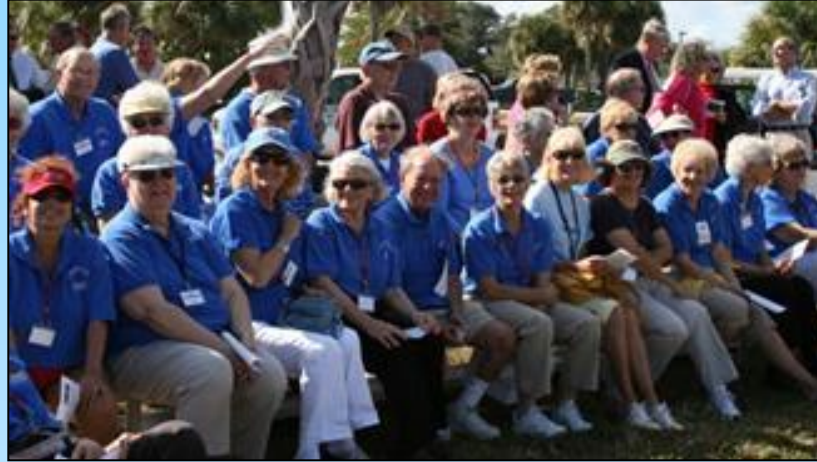
LRHS' Volunteers - 100 strong