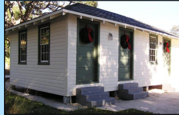
1924 Workshop now used for exhibits and meetings