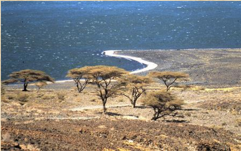
Lake Turkana: worlds largest alkaline lake