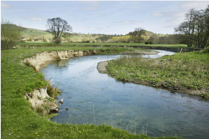
Two Rivers Wisconsin