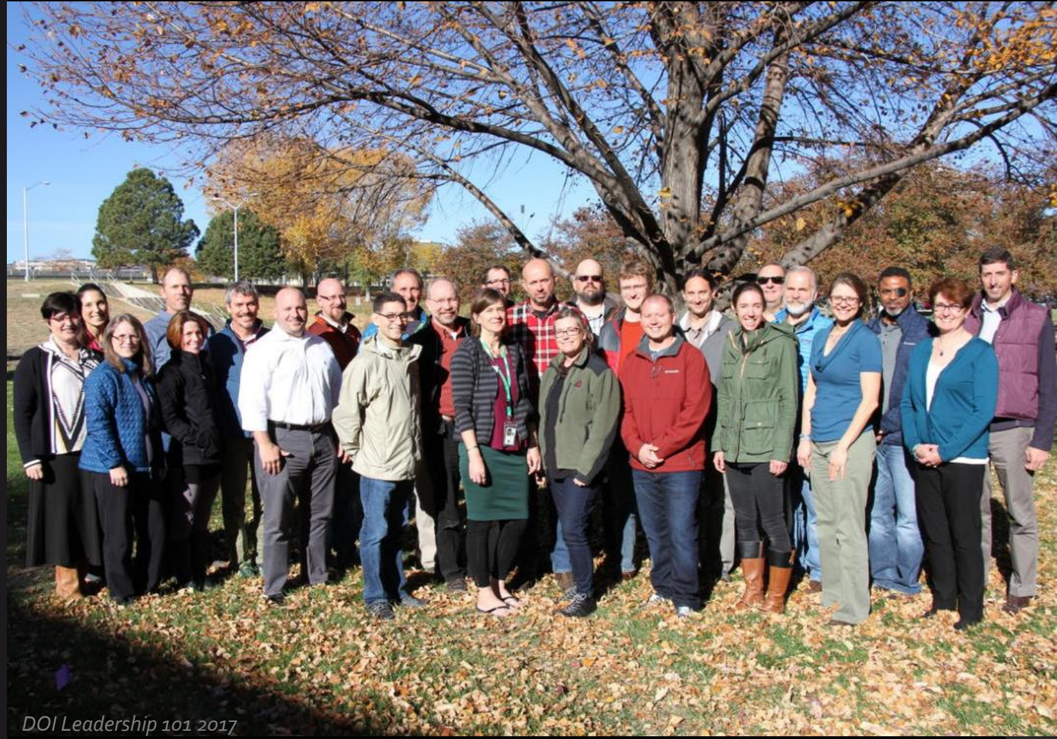
DOI Leadership 101 2017

Interior Coach Training Program (ICTP) Sharepoint site